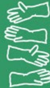
2 (TWO) PAIRS OF GLOVES