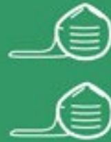
2 (TWO) CHISTRAPS